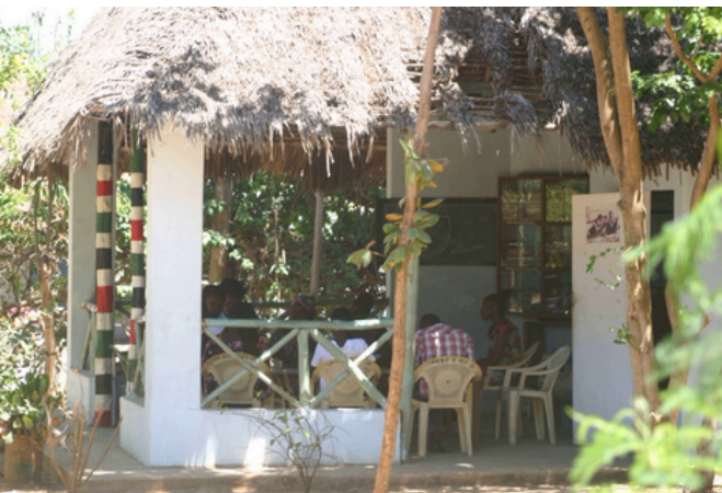
Figure 1: Before renovation