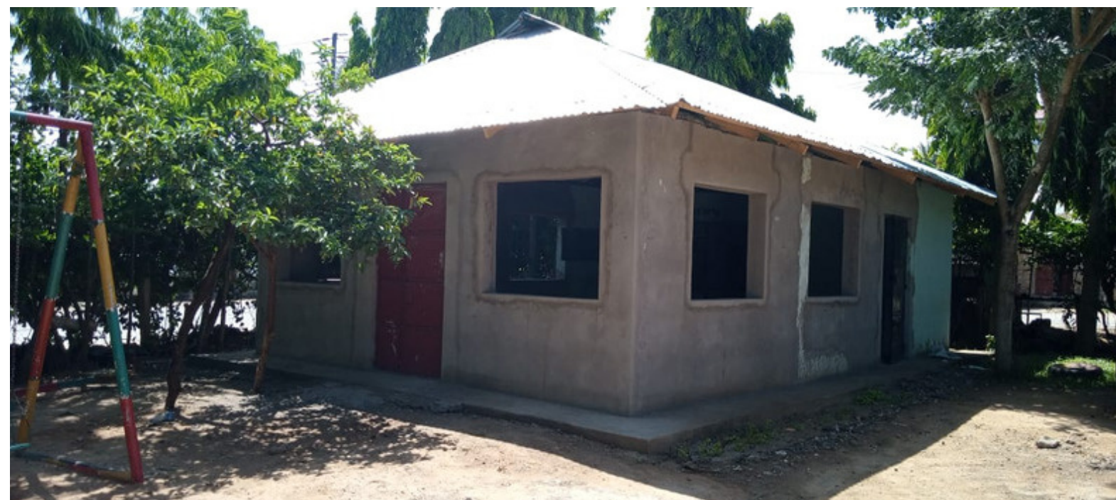
Figure 2: After renovation

A library is an important facility to a community. The resources and services they offer create opportunities for learning, support literacy and education, and help shape the new ideas and perspectives that are central to a creative and innovative society.